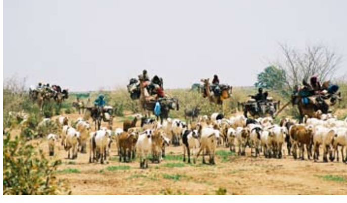
Pastoralists from South Kordofan, Sudan, arriving in neighbouring North Kordofan for wet-season grazing.

In recent years some governments have shown greater awareness of the importance of livestock mobility for dryland ecosystems. New legislation in Burkina Faso, Guinea, Mali and Mauritania sets out pastoralists' rights to move their animals within and across national borders. However, government officials' limited understanding of pastoral systems means that this legislation is likely to be implemented in an unduly technocratic and centralised way, thus in practice continuing to curtail mobility. Moreover, while the various regional integration processes across Africa permit the free movement of people and goods, pastoralists still face many practical difficulties when moving their animals across borders.